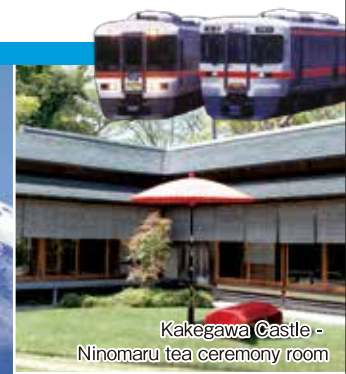
Kakegawa Castle - Ninomaru tea ceremony room