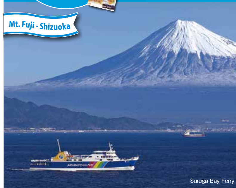
Suruga Bay Ferry