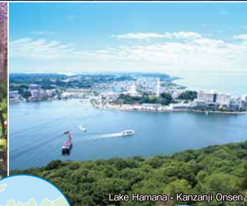
Lake Hamana - Kanzanji Onsen